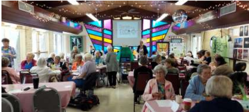
The ladies from Ascension attended the Pineland's Conference on Saturday March 18 at St. Matthew's Church.