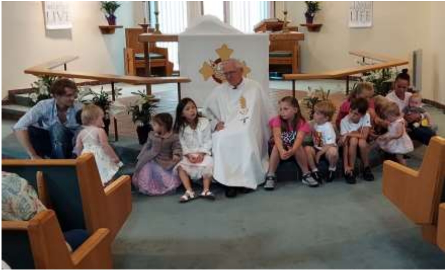
Our new altar banners added to the Easter beauty of the altar.